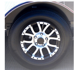
TWO TONE ALUMINUM